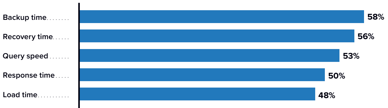
FIGURE 3 Database Performance KPIs (% quicker)

n = 7; Source: IDC Business Value In-Depth Interviews, February 2024